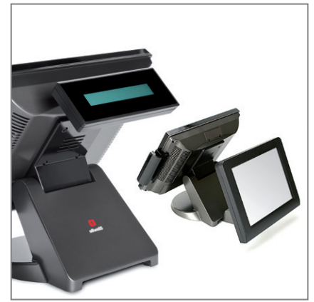
CUSTOMER DISPLAY OR LCD SECOND DISPLAY (optional)