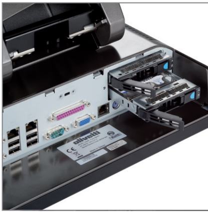
SUPPORT DUAL LAN, TWO REMOVABLE HARD DISK DRIVES AND RAID FUNCTION